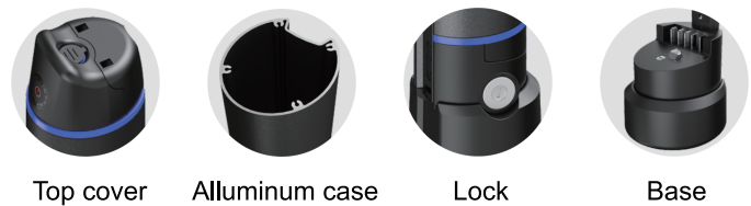
Top cover Alluminum case Lock Base